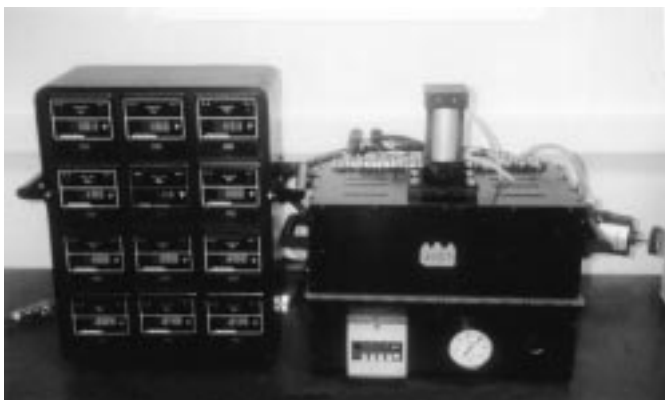
FIG. 1 Thermal Response Fixture

8.2 Cut samples into individual strips 5 by 18 in. (127 by 457.2 mm) if the test instrument described in this test method is used, or cut to a size that will fit the test instrument used.