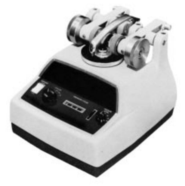
FIG. 1 Rotary Platform Double Head Abrader

5.11 If there are differences of practical significance between reported test results for two laboratories (or more), comparative tests should be performed to determine if there is a statistical bias between them, using competent statistical assistance. As a minimum, the test samples used are to be as homogeneous as possible, drawn from the material from which the disparate test results were obtained, and randomly assigned in equal numbers to each laboratory for testing. The test results from the two laboratories should be compared using a statistical test for unpaired data, at a probability level chosen prior