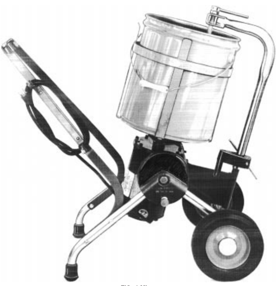
FIG. 4 Mixer

11.1.2 The manufacturer's designation for the grout tested and batch number of the grout components;