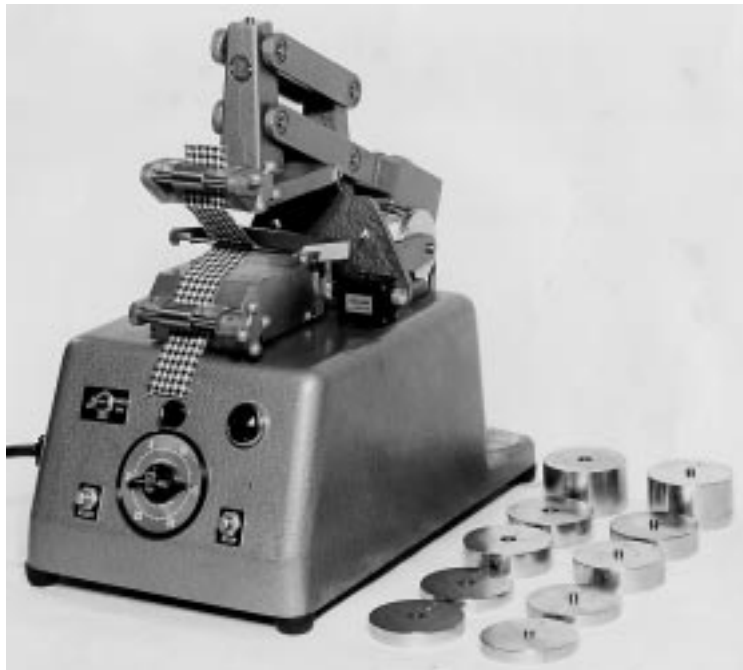
FIG. 2 Commercial Flexing and Abrasion Tester

thoroughly with water and consult physician; perform operations under a fume hood with the exhaust on; store in an approved, labeled safety can; and dispose of used Stoddard solvent as directed by city, state, or federal ordinances, as required. Refer to the manufacturer's Material Safety Data Sheets (MSDS) for information on handling, use, storage, and disposal of material and reagents used with this test method.